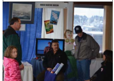
Visitors at the 2015 KMM Comfish booth.