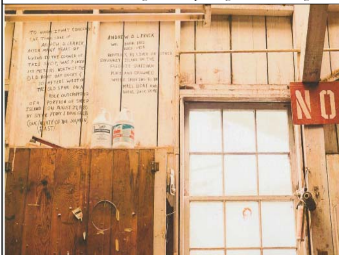
Directions to a grave site on the wall of the Uganik Cannery wood shop.

The west side setnet gillnet fishery has been a part of Kodiak’s salmon industry since the late 19th century., and dozens of Kodiak fishing families continue to participate each summer.