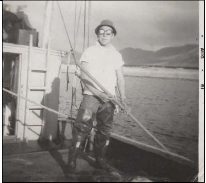
Plunging off the Karluk Spit, August 1961.

A geotech survey of the site was also conducted in December to help PND Engineering identify the underlying soil and rock in