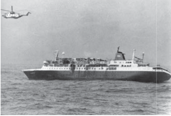
The Prinsendam listing in the Gulf of Alaska October 4, 1980