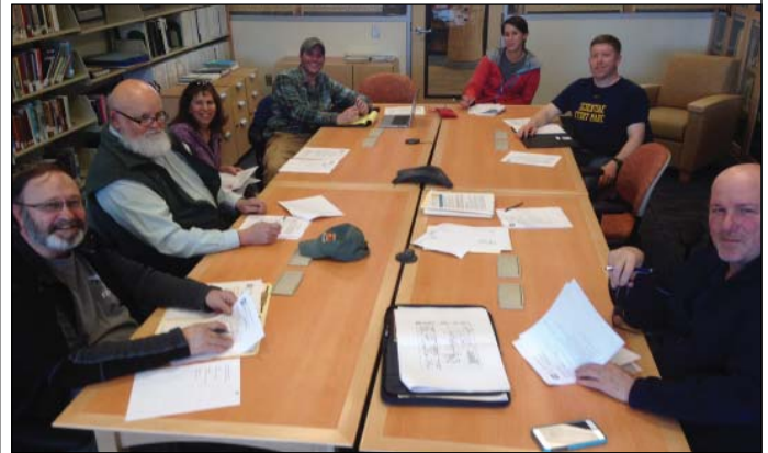
Kodiak Maritime Museum's Board of Directors

From the very beginning in 1992, when four local fisherwomen sat down and began planning for the creation of the Kodiak Maritime Museum, the organization has depended on volunteer citizens to keep Kodiak's maritime history alive.