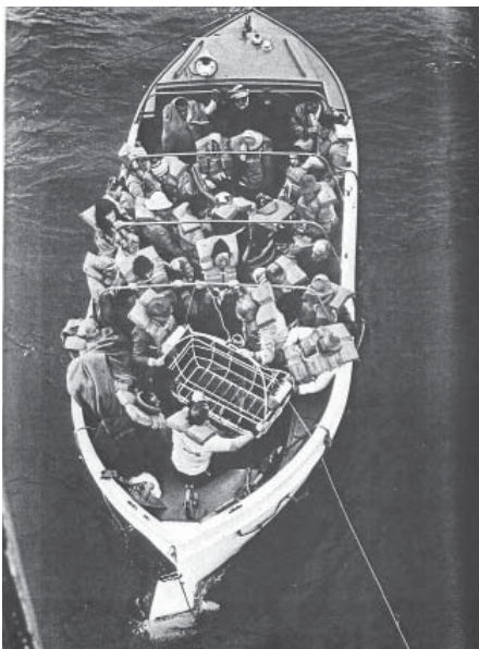
Prinsendam survivors, October 4, 1980.

The Williamsburg arrived around 8 a.m. and Coast Guard helicopters began ferrying people from the lifeboats to a helipad on the tanker. A Coast Guard doctor triaged the passengers and put those in poor shape onto helicopters headed for Yakutat to refuel. Various passengers were afflicted with malaria, epileptic seizures and terminal cancer. All of them were cold, wet, and hungry.