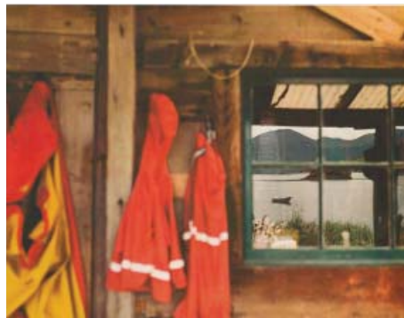
Raingear hanging on the porch at Gull Light setnet site, Uganik Bay.